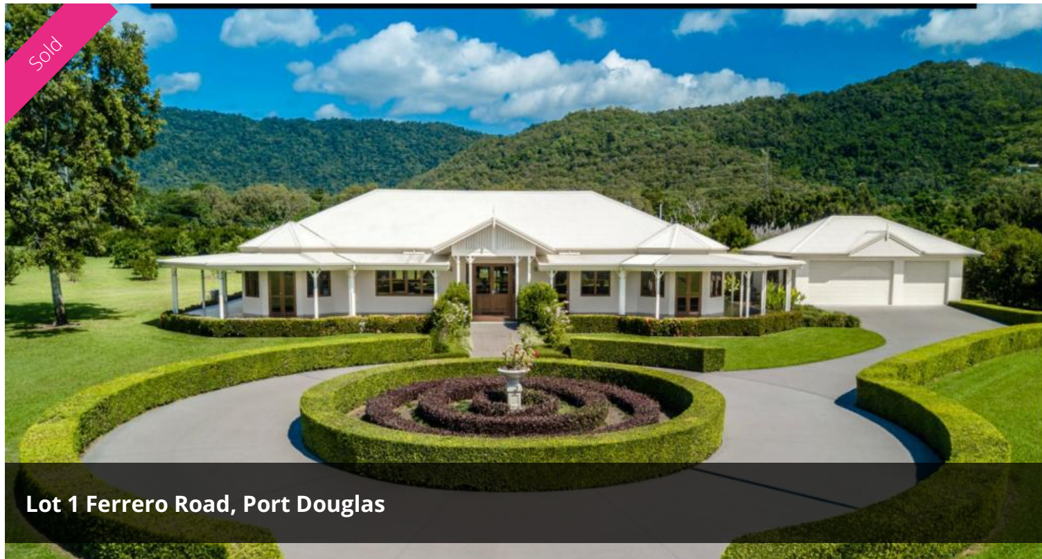
Lot 1 Ferrero Road, Port Douglas