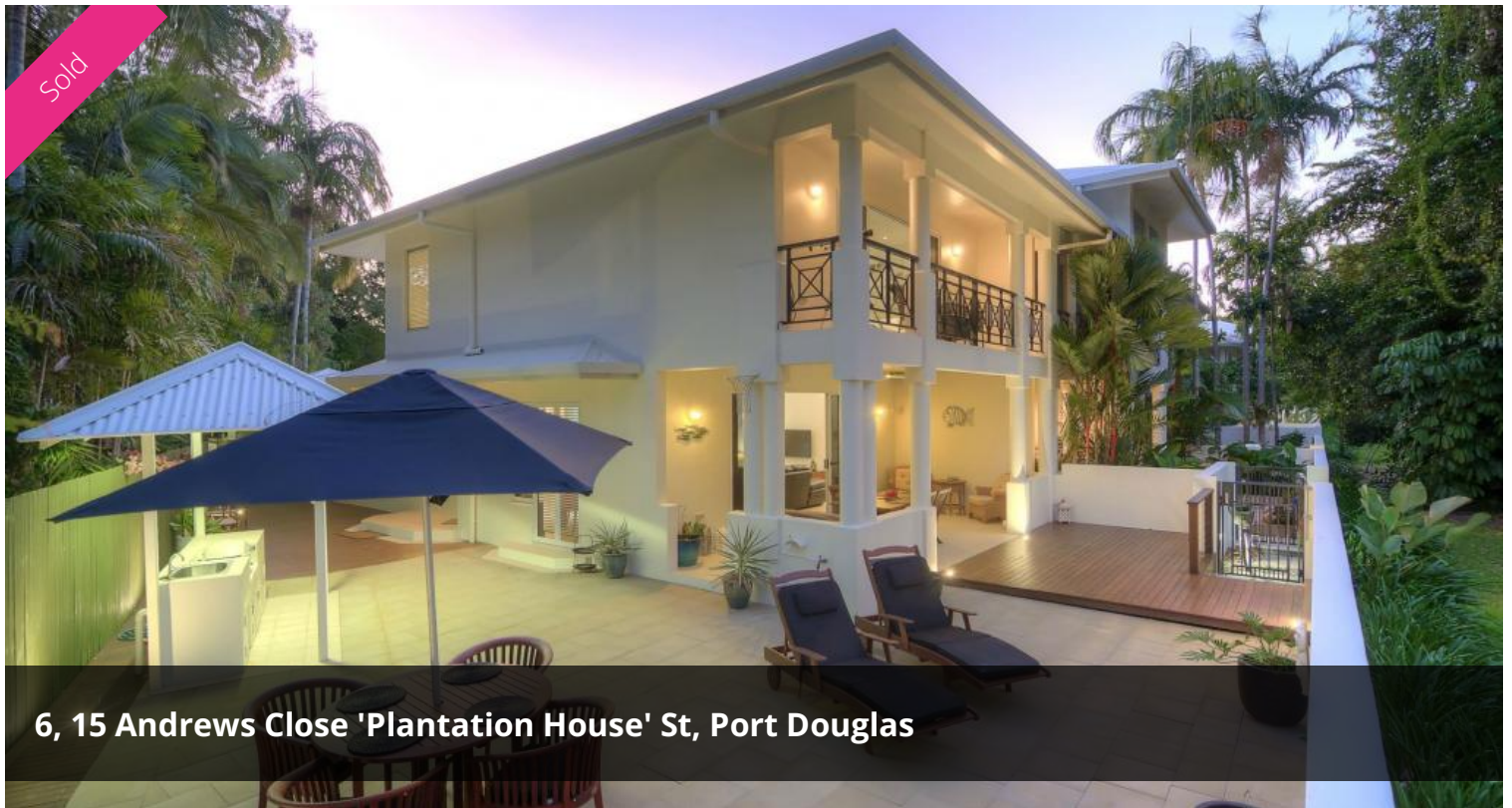
6, 15 Andrews Close 'Plantation House' St, Port Douglas