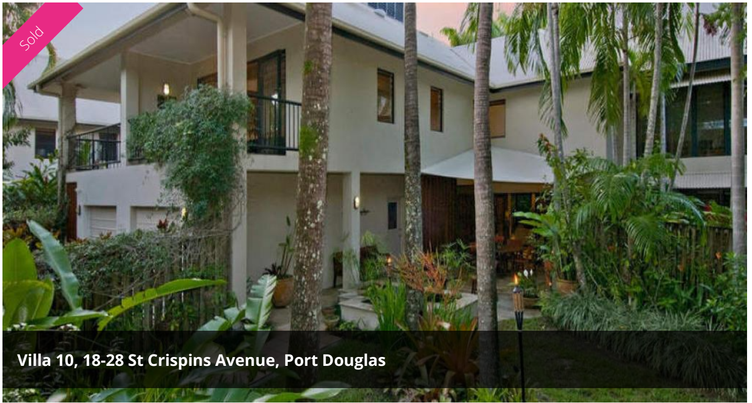
Villa 10, 18-28 St Crispins Avenue, Port Douglas