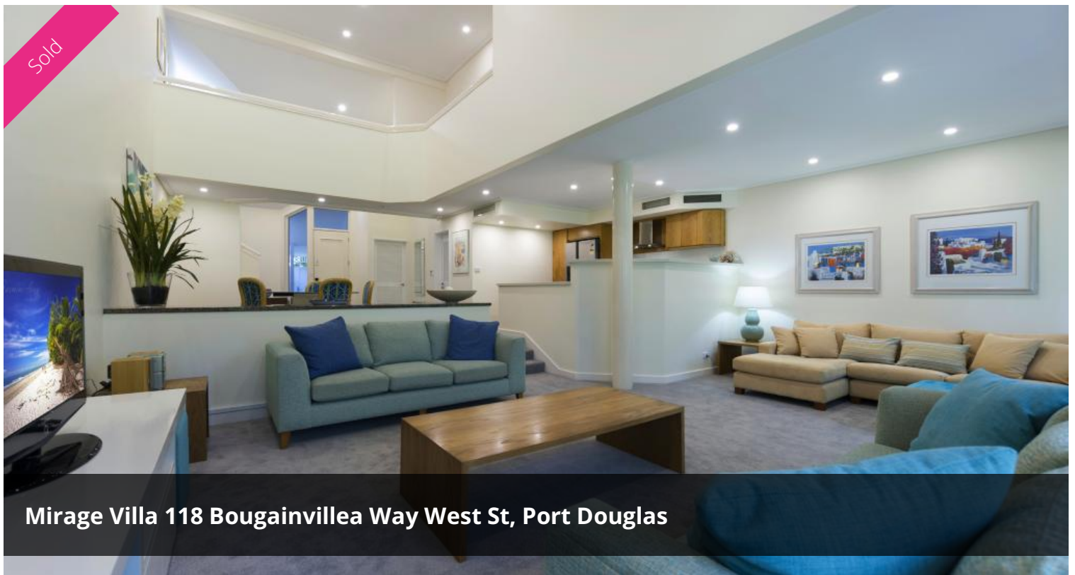
Mirage Villa 118 Bougainvillea Way West St, Port Douglas