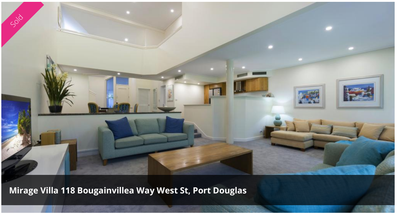
Mirage Villa 118 Bougainvillea Way West St, Port Douglas