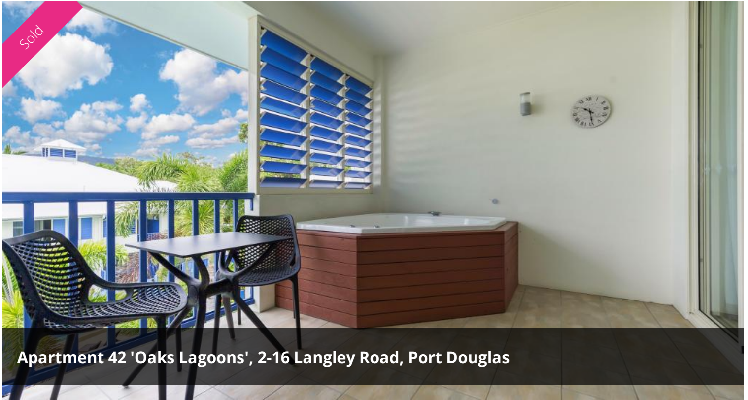
Apartment 42 'Oaks Lagoons', 2-16 Langley Road, Port Douglas