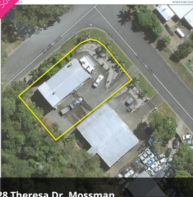
28 Theresa Dr, Mossman