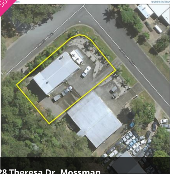
28 Theresa Dr, Mossman