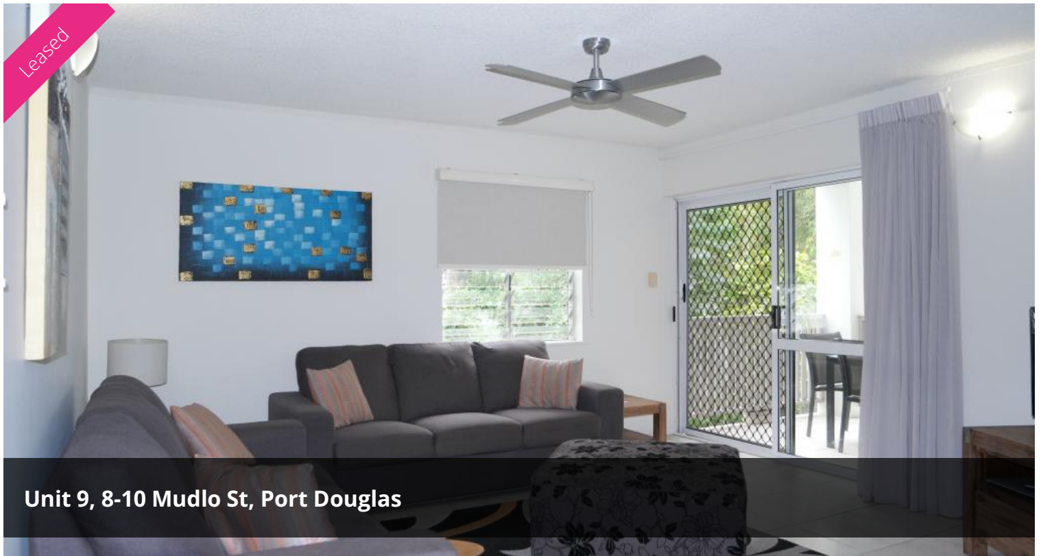
Unit 9, 8-10 Mudlo St, Port Douglas