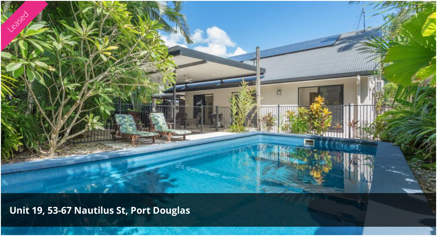
Unit 19, 53-67 Nautilus St, Port Douglas