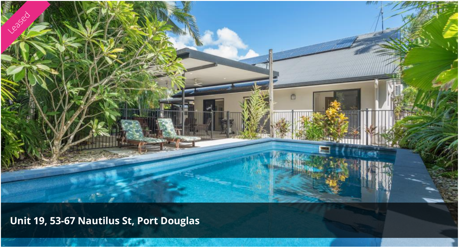
Unit 19, 53-67 Nautilus St, Port Douglas