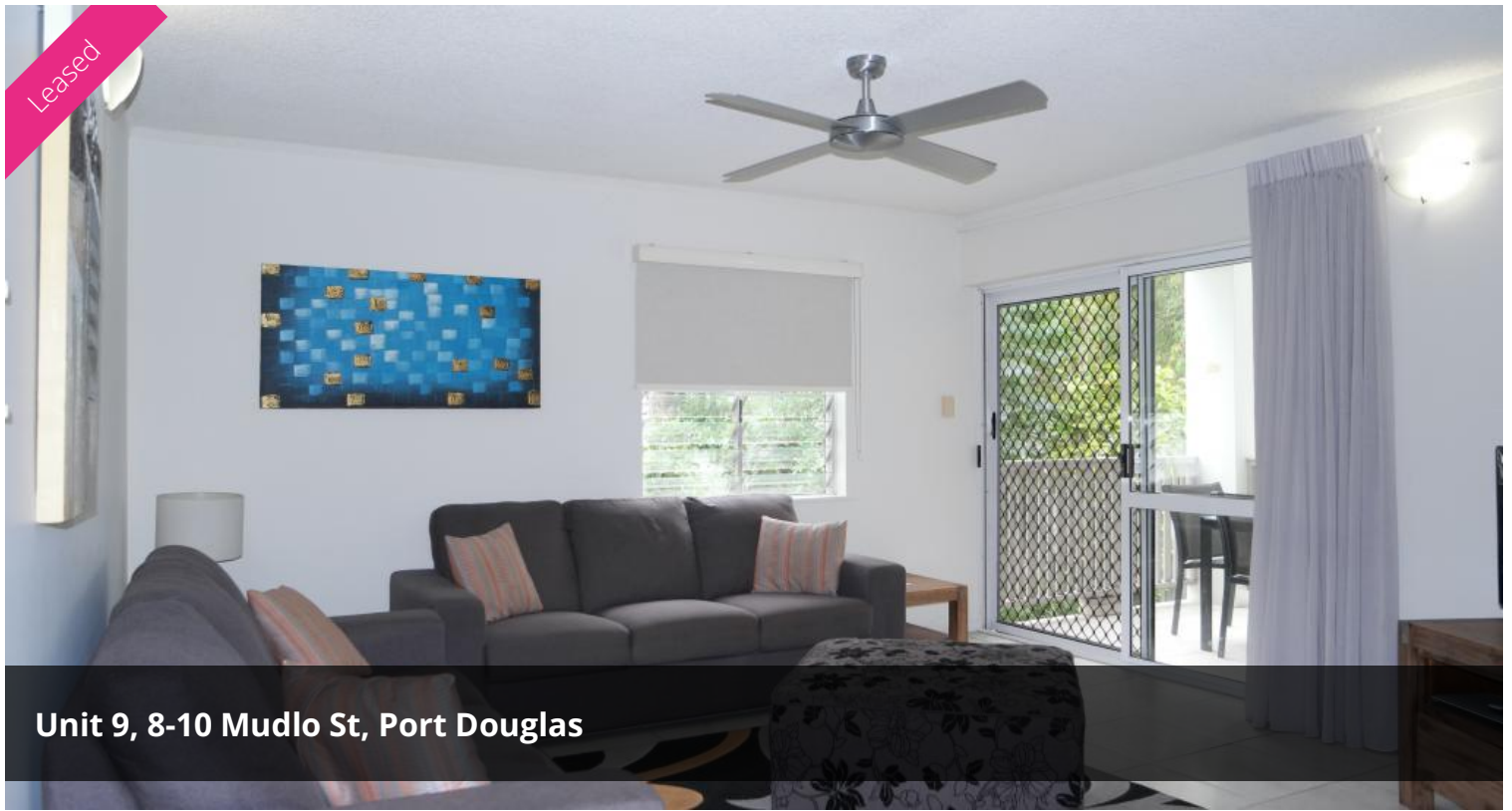
Unit 9, 8-10 Mudlo St, Port Douglas