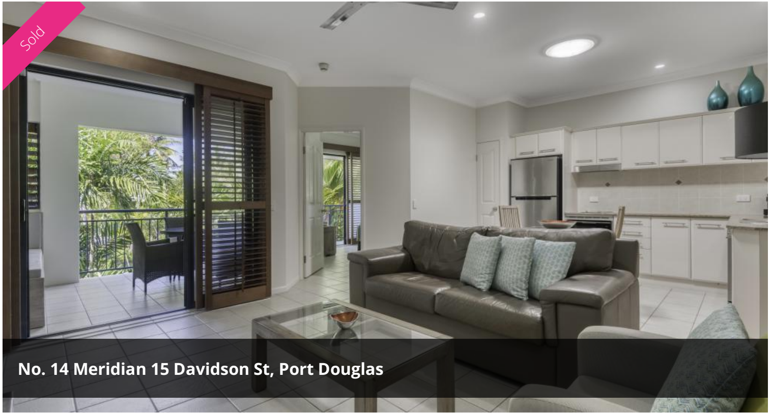
No. 14 Meridian 15 Davidson St, Port Douglas