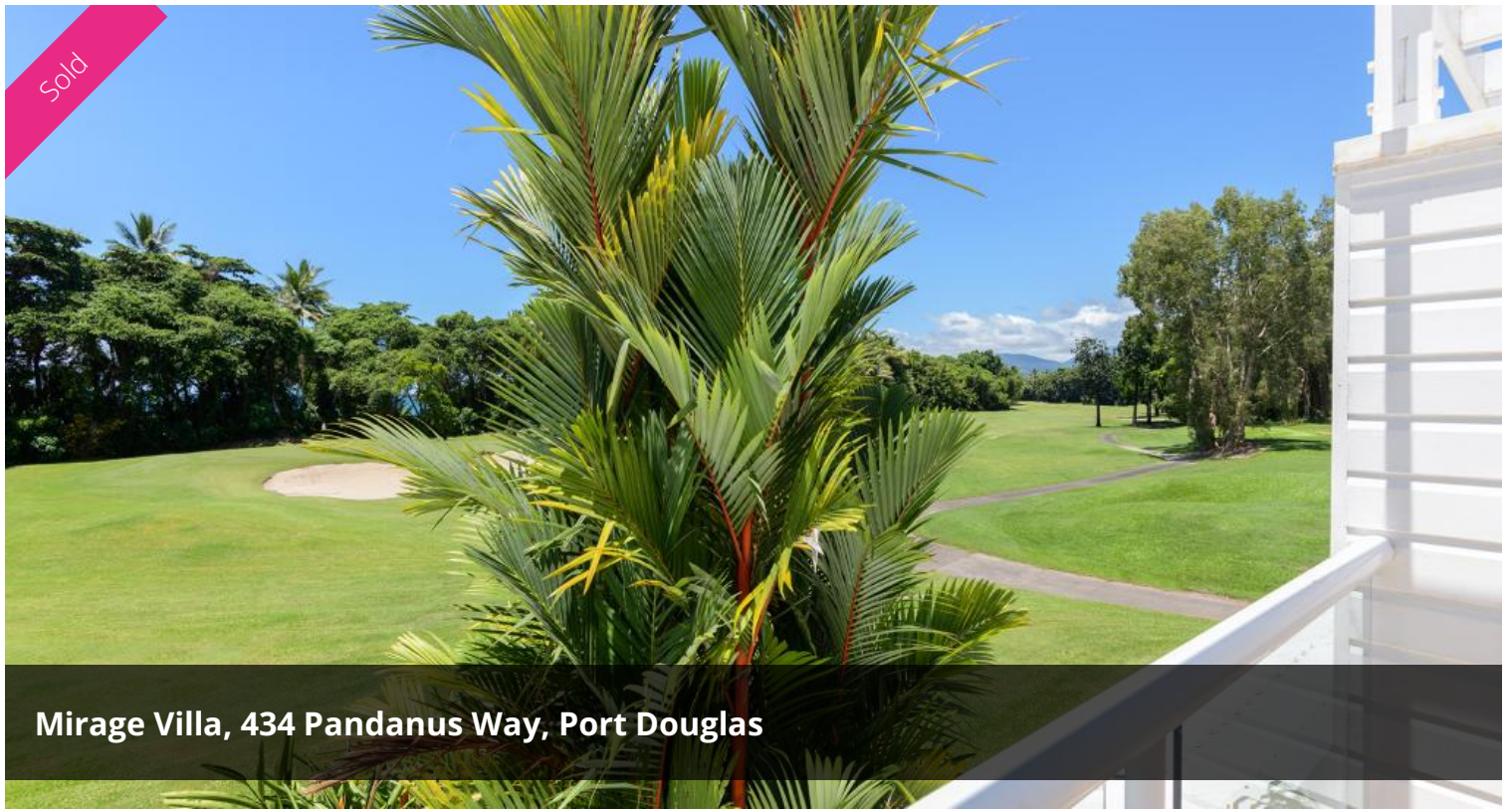
Mirage Villa, 434 Pandanus Way, Port Douglas