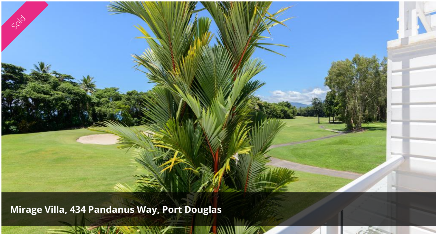
Mirage Villa, 434 Pandanus Way, Port Douglas