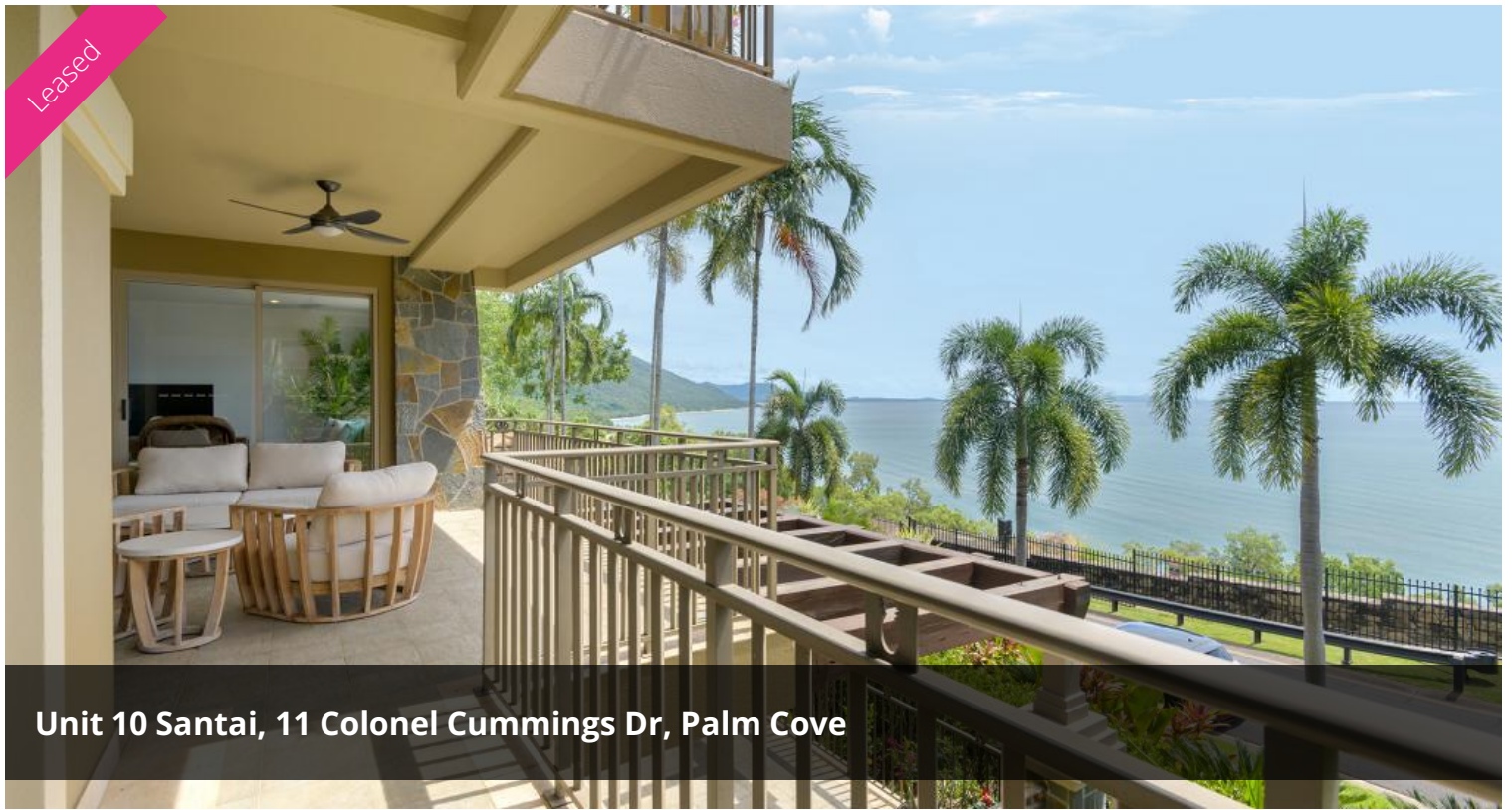
Unit 10 Santai, 11 Colonel Cummings Dr, Palm Cove