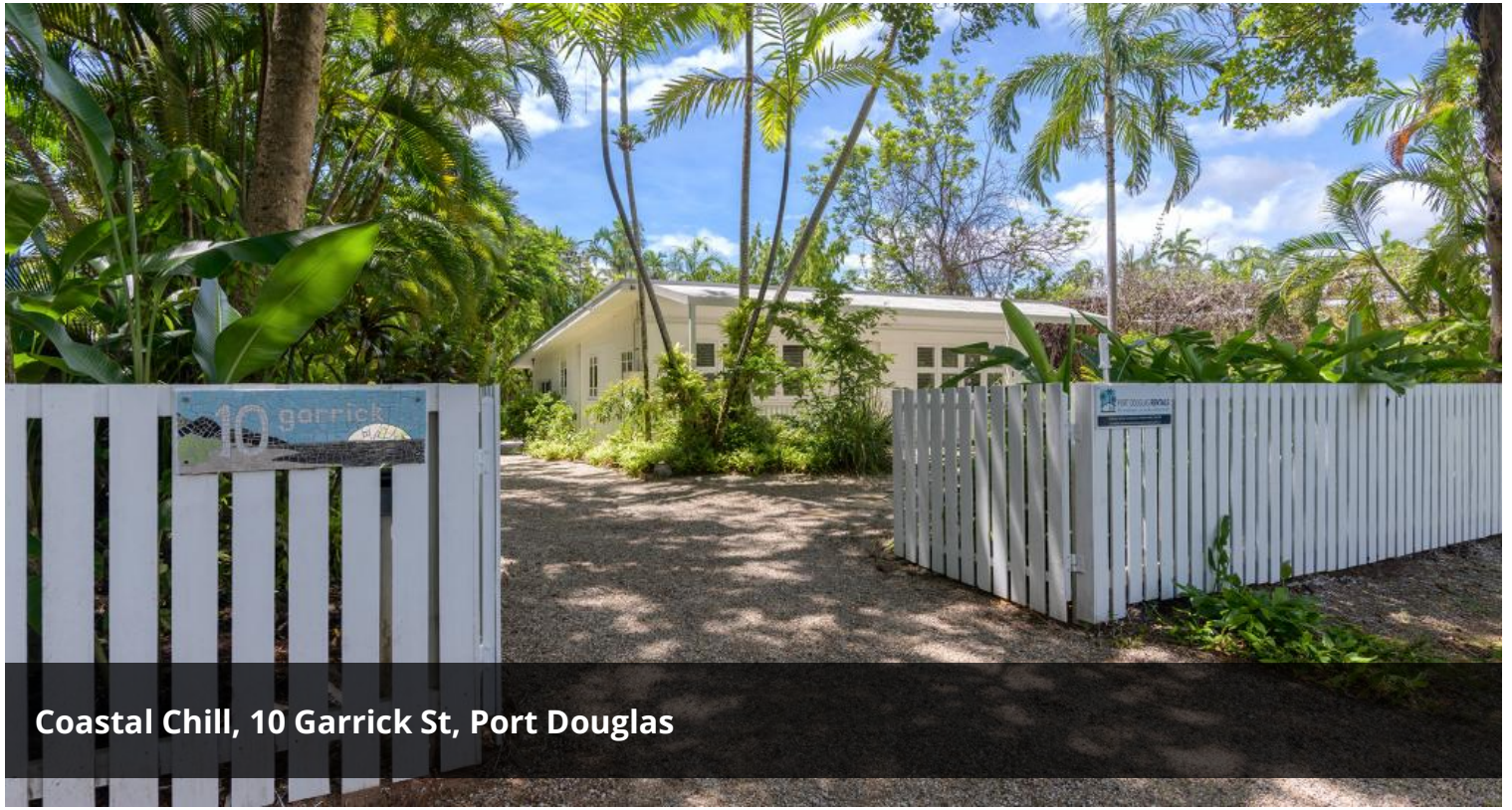
Coastal Chill, 10 Garrick St, Port Douglas